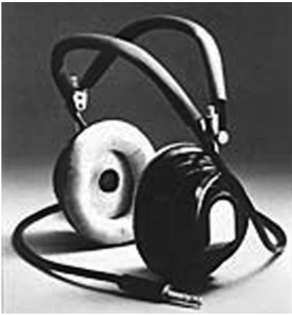
Fig. 2. Koss SP-3 Stereoheadphone, 1958. The first commercially available stereo headphones, which allowed for spatial manipulations of sound within the head.

acoustic experience can be created, unlike anything else in the history of listening—except, that is, for its immediate precursor: the stereo stethoscope [7]. It follows that the stethoscope deserves attention for its creation of a technique of listening that continues in the technology of headphones.