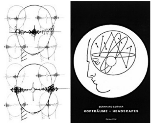
Fig. 3. Bernhard Leitner, Headscapes Oscillating Space , 2002. (© Bernhard Leitner)

At first "Continuum" simply repeats the spatial remapping established by the stethoscope: the internal heartbeat sample from someone else's chest mapped into one's own cranium. This subtle and classic bodily exchange is further supported when halfway through the track a spatial murmur punctures the sound-field, creating a floating hole in the head that opens into an ambiguous space that reveals our leaky souls. The Baroque monad may be windowless, but headphones are a neo-Baroque infrastructure, allowing spotlights from hidden realms to ripple an interior space [18].