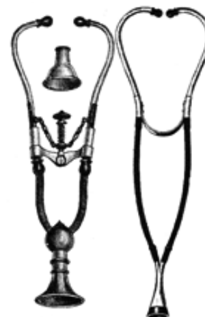
Fig. 1. With binaural stethoscopes the experience of “in-head” acoustic imaging first became possible.

Working from a phenomenological position, the author investigates “in-head” acoustic localization in the context of the historical development of modern listening. Starting from the development of the stethoscope in the early 19th century, he traces novel techniques for generating space within the body and extrapolates from them into contemporary uses of headphones in sound art. The first half of the essay explores the history, techniques and technology of “in-head” acoustics; the second half presents three sound artists who creatively generate headphone spatializations. The essay ends with reflections on how these sound “imaging” techniques topologically shape our subjectivities.