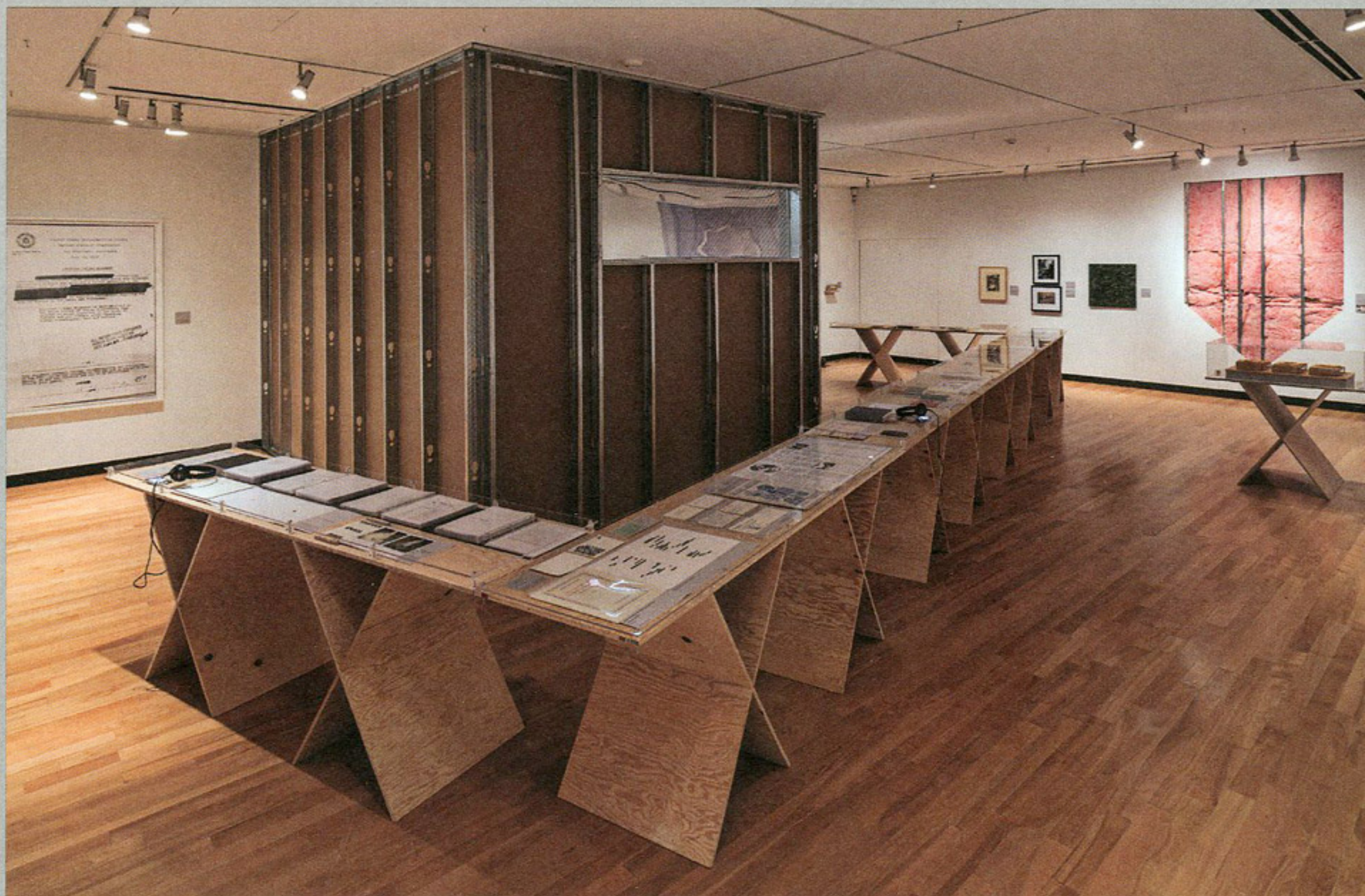
CounterIntelligence , 2014, view of the exhibition